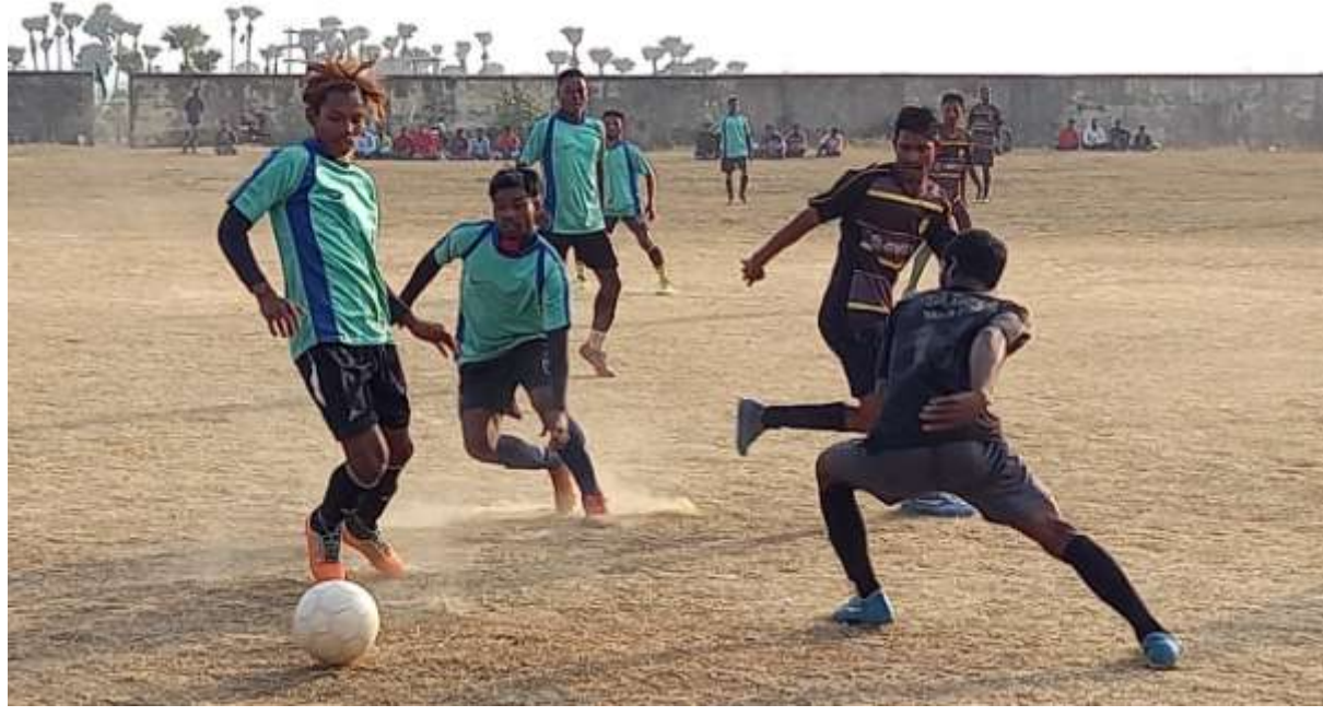
Helping Cancer Fighters and Charity Football Match