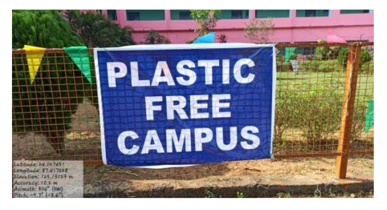
Plastic Free Campus