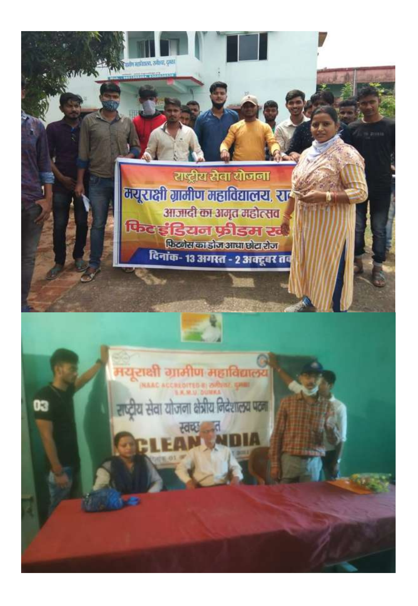
Different types of programmes/ outreach Programmes Organised by NSS and NCC.